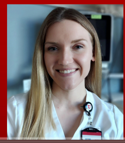
Clinical Nurse Coordinator, U of U Health Surgical ICU Hospitals & Clinics District